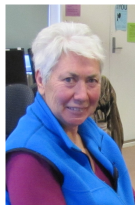
Evelyn Street (Vmt Sth)